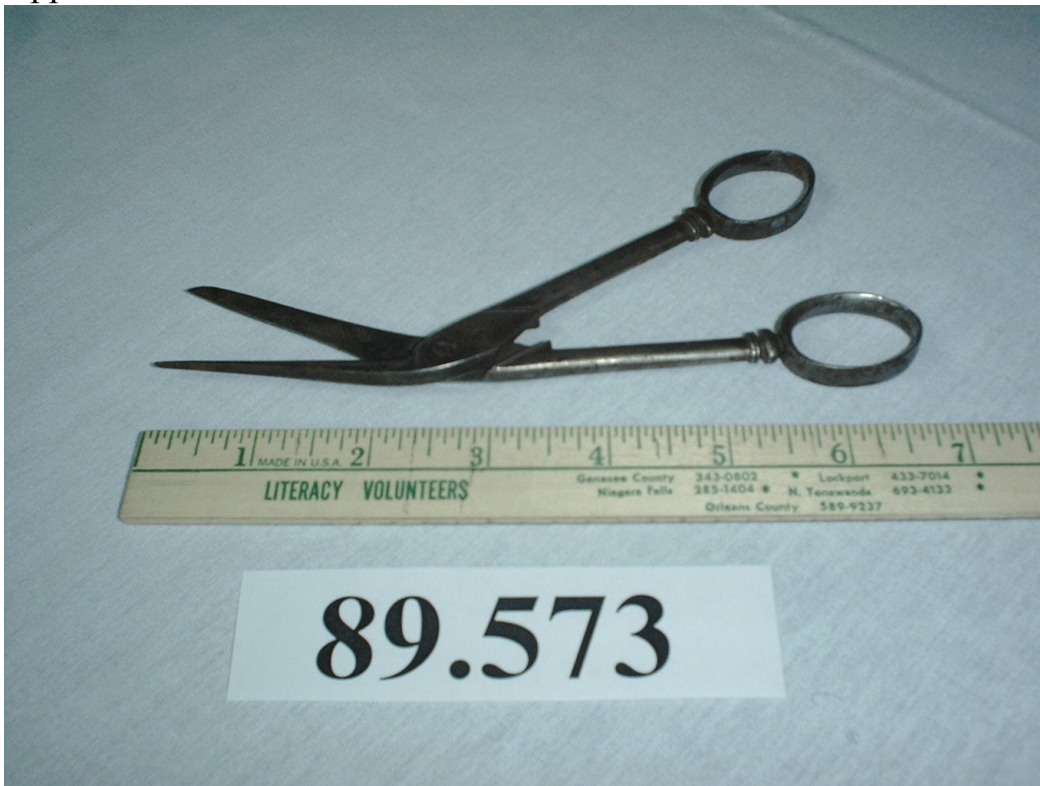
Appendix Item A610